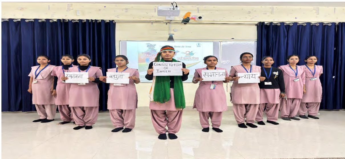
Skit by B. Sc Nursing 6 th Semester Students.